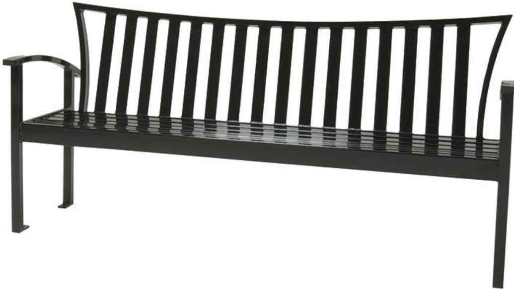
Exeter (Carpenter Park) $1430